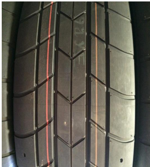
Full Tread Depth