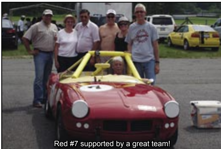
Red #7 supported by a great team!